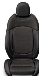
Cloth/leatherette combination Carbon Black | Carbon Black Sport seat

Ultimate comfort, classic Union Jack design on the front of the headrest, striking piping and immaculate workmanship. In a MINI Yours sport seat, you can really feel the difference, however long the drive.