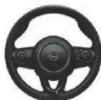
Sport leather steering wheel with multi-function controls