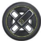
17" Electric Corona Spoke in two-tone