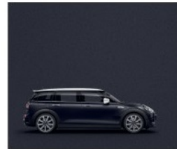
Thunder Grey 1/3