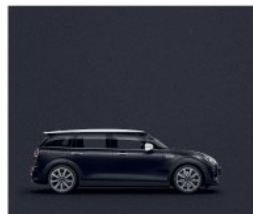
Special colour MINI Yours Enigmatic Black 3