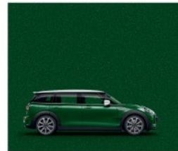
British Racing Green 1