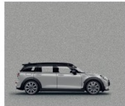
Melting Silver 1