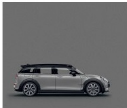
Standard colour Moonwalk Grey 1

What would life be without the power of colour? Create a look that reflects your personality with one of our 12 specially blended elegant paint colours, all designed to enhance the Clubman's unique character. The three contrast colours for the roof and mirror caps provide scope for an even more personalised look. The alloy wheels are available in 3 different designs, ranging in size 17" and 18".