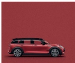
Indian Summer Red 1