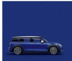
Starlight Blue 1