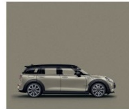
Emerald Grey 1