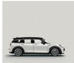
White Silver 1/2