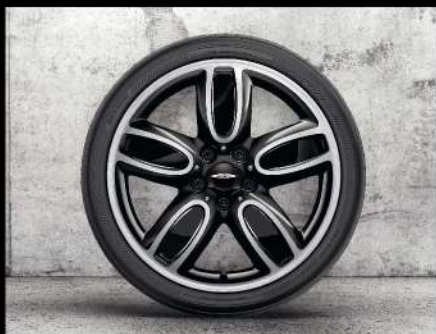
18" John Cooper Works Cup Spoke 2-tone