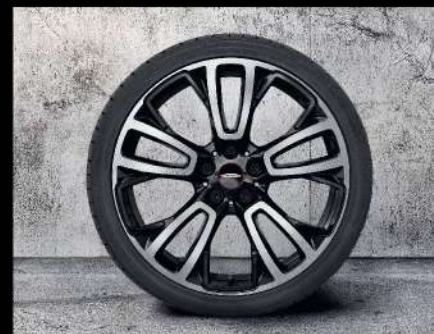
19" John Cooper Works Circuit Spoke 2-tone