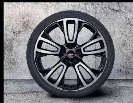
19" John Cooper Works Circuit Spoke 2-tone