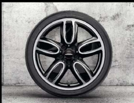
18" John Cooper Works Cup Spoke 2-tone