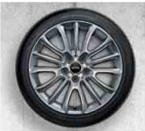
17" Net Spoke light-alloy wheels in Silver