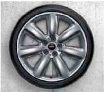
18" Star Spoke light-alloy wheels in Silver