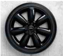
18" Star Spoke light-alloy wheels in Black